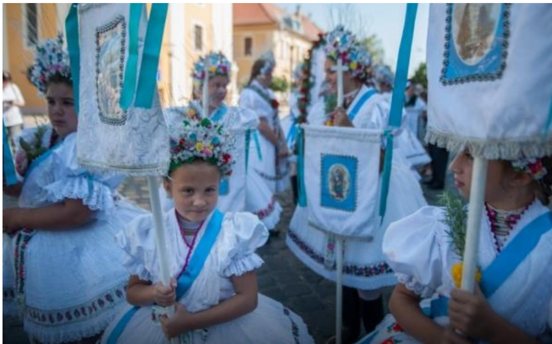
Szent Anna búcsú, Balassagyarmat