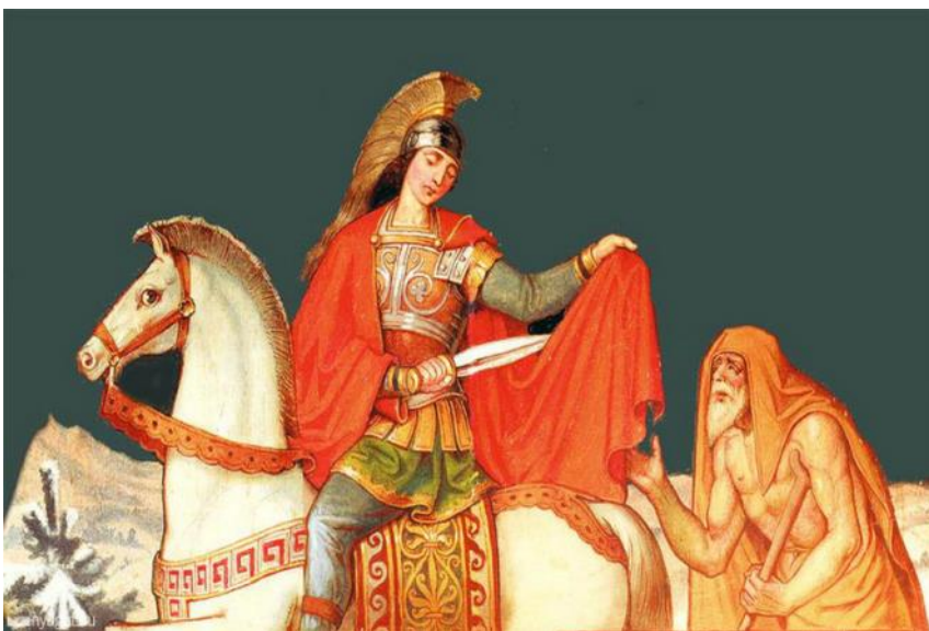
Tours-i Szent Márton püspök

Idén is szeretnénk szilveszteri bált rendezni, kérjük, hogy a templom előtérében kitett lapon előzetesen jelentkezzenek és azt is jelezzék, ha vendégeket hoznak. Ez még nem számít jelentkezésnek, csak szeretnénk tájékozódni.