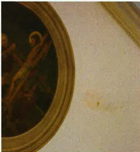
LEAKS AND CEILING REPAIR