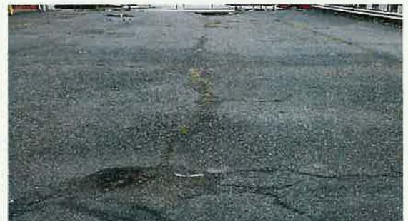
PARKING LOT REPLACEMENT