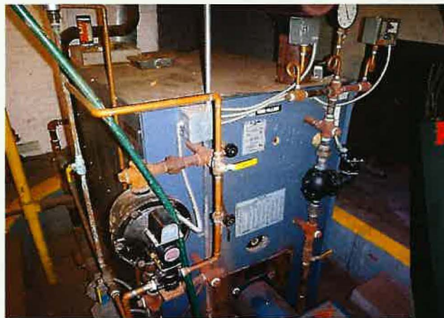
HVAC AND ELECTRIC UPGRADE