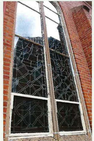
STAINED GLASS WINDOW REPAIR