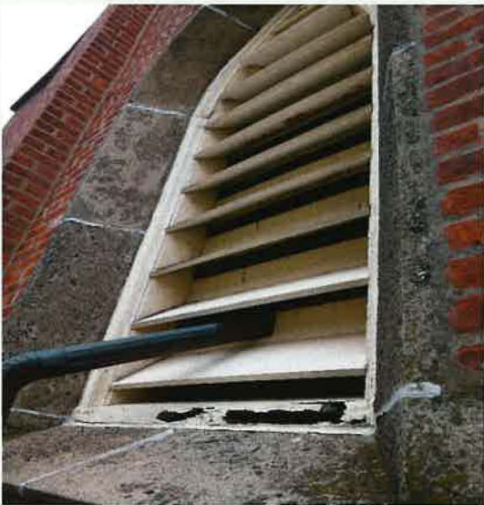
BELL TOWER REPAIR