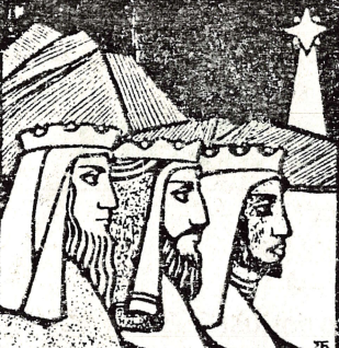
They followed his star

TODAY THE CHURCH CELEBRATES THE FEAST OF THE EPIPHANY OF THE LORD. The star shining in the sky to guide the wise men is pointing to something even brighter; the glory of God revealed in the Infant Jesus. Today the church is called to come before that child and to praise God for letting us see his own glory.